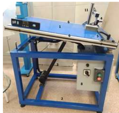
Figure 2: View of the offer of hotels and other tourist accommodation in the city of Alicante.