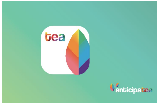
Image 2. App logo as it appears