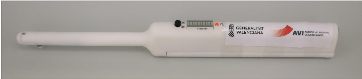
Image 1. Prostate palpation device