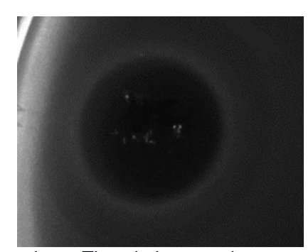
Figure 2: Result of a spot test experiment carried out with UK-C at a concentration of 16 µg/mL on an E. coli strain. Bacterial growth is visualized as a gray layer on the

plate. The dark central area, where the protein solution was loaded, indicates the inhibitory effect in growth produced by the endolysin.